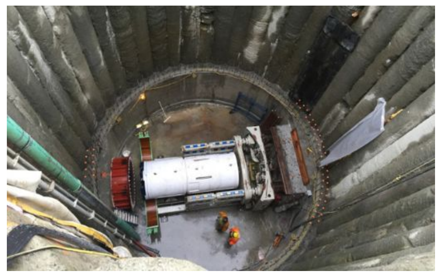
15.2m deep caisson to accomodate the vertical turbine pumps and shafts

Because of how close construction was to the lake, a significant amount of effort was put in to mitigate risks, especially in terms of environmental impact.