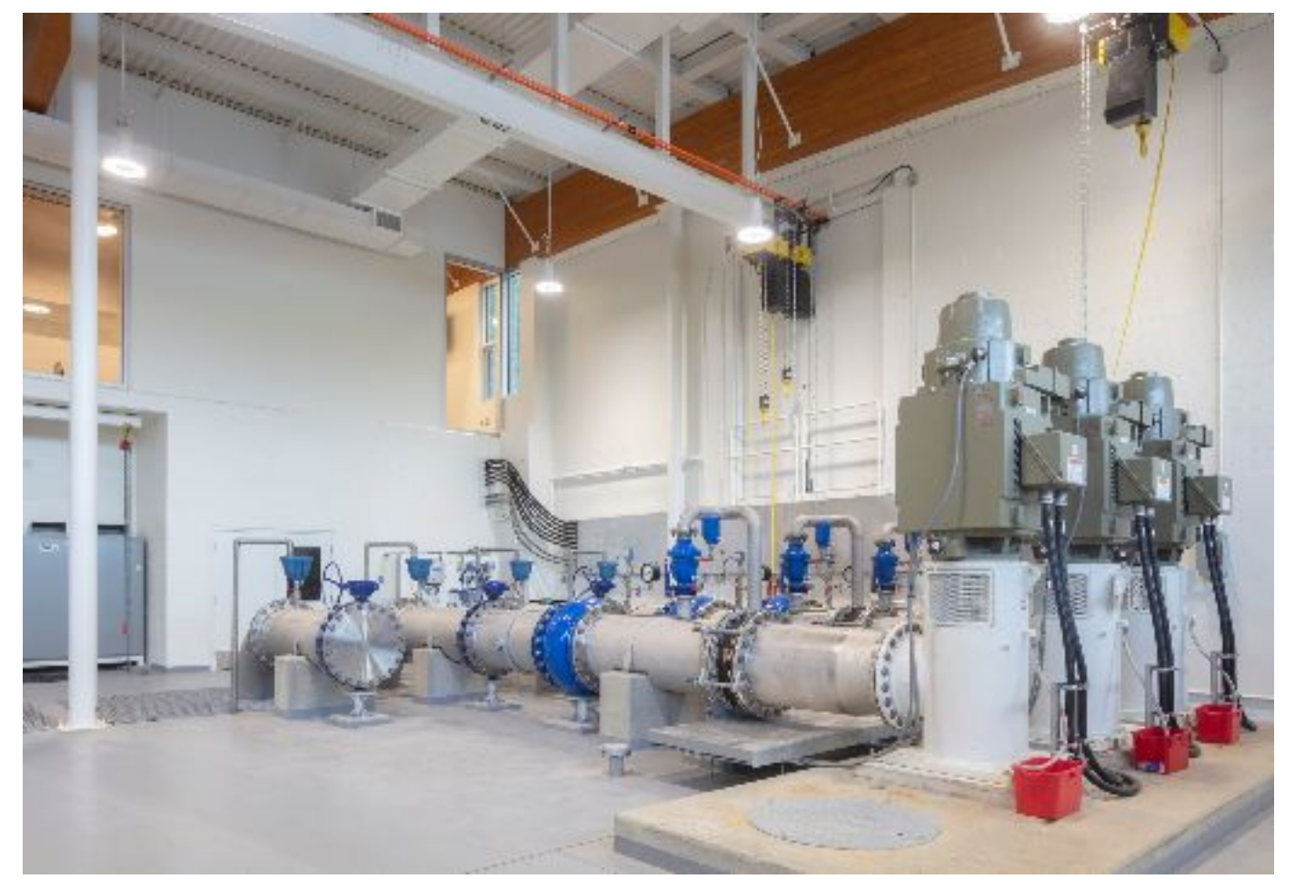
Vertical turbine pumps

Transforming an industrial building into an iconic design and educational landmark was part of the City's goals, which lead to a built-in view room and a social space to encourage learning within the community about the workings of a crucial infrastructural piece.