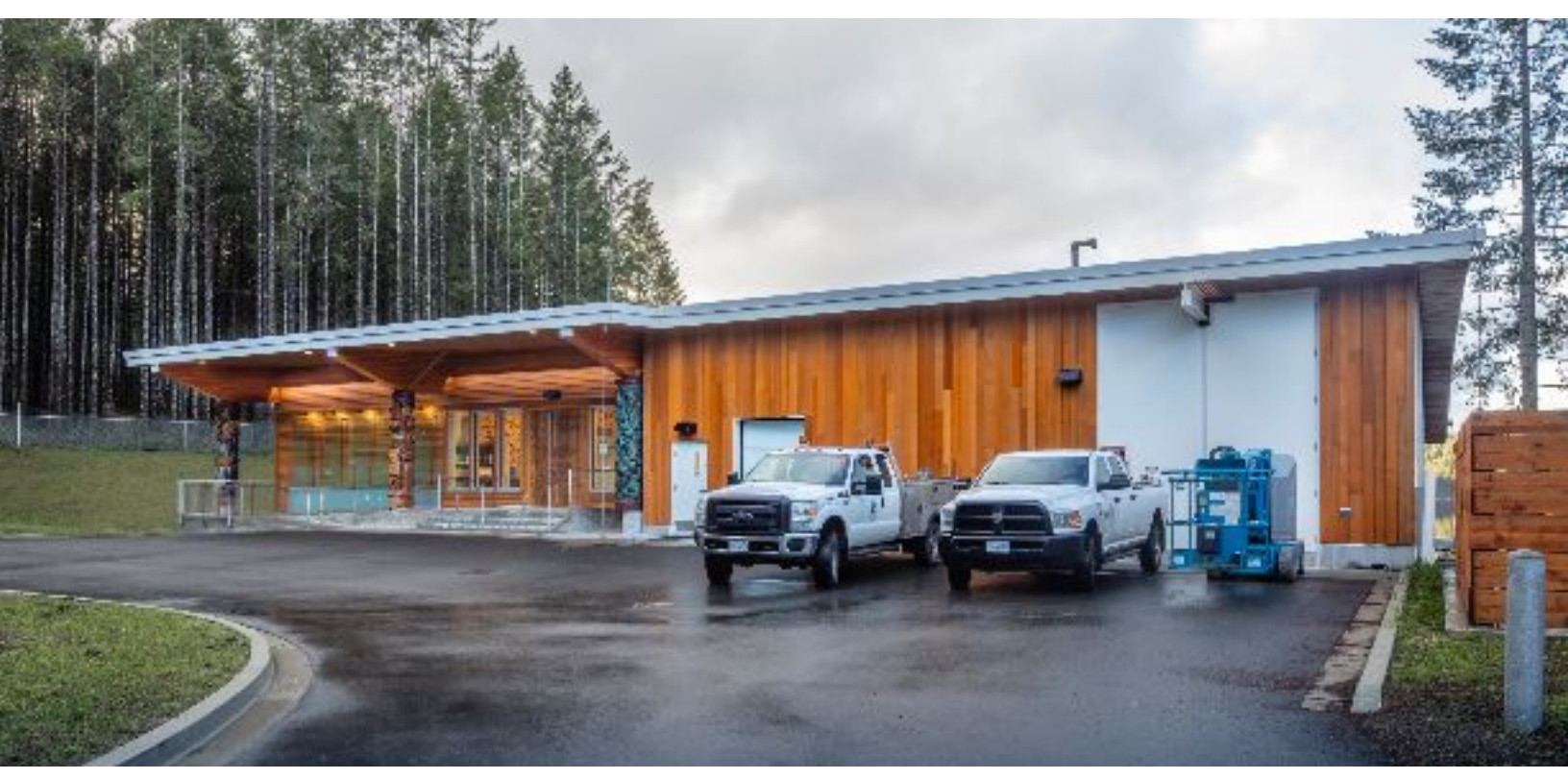
The exterior design of the Campbell River Water Supply Centre, which was a collaboration between Stantec, the City, and the Wei Wai Kum First Nation band

Stantec prepared an Environmental Protection Plan (EPP) prior to construction which was required to befollowed closely by the contractor during construction. The contractor was also required to retain a Qualified Environmental Professional (QEP) to ensure compliance with the requirements of the contract, including turbidity monitoring in the lake and around the previous intake location to ensure public health was not impacted by the project through potentially drinking turbid water from construction activities.